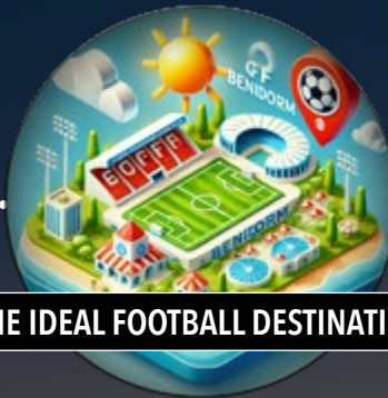
THE IDEAL FOOTBALL DESTINATION